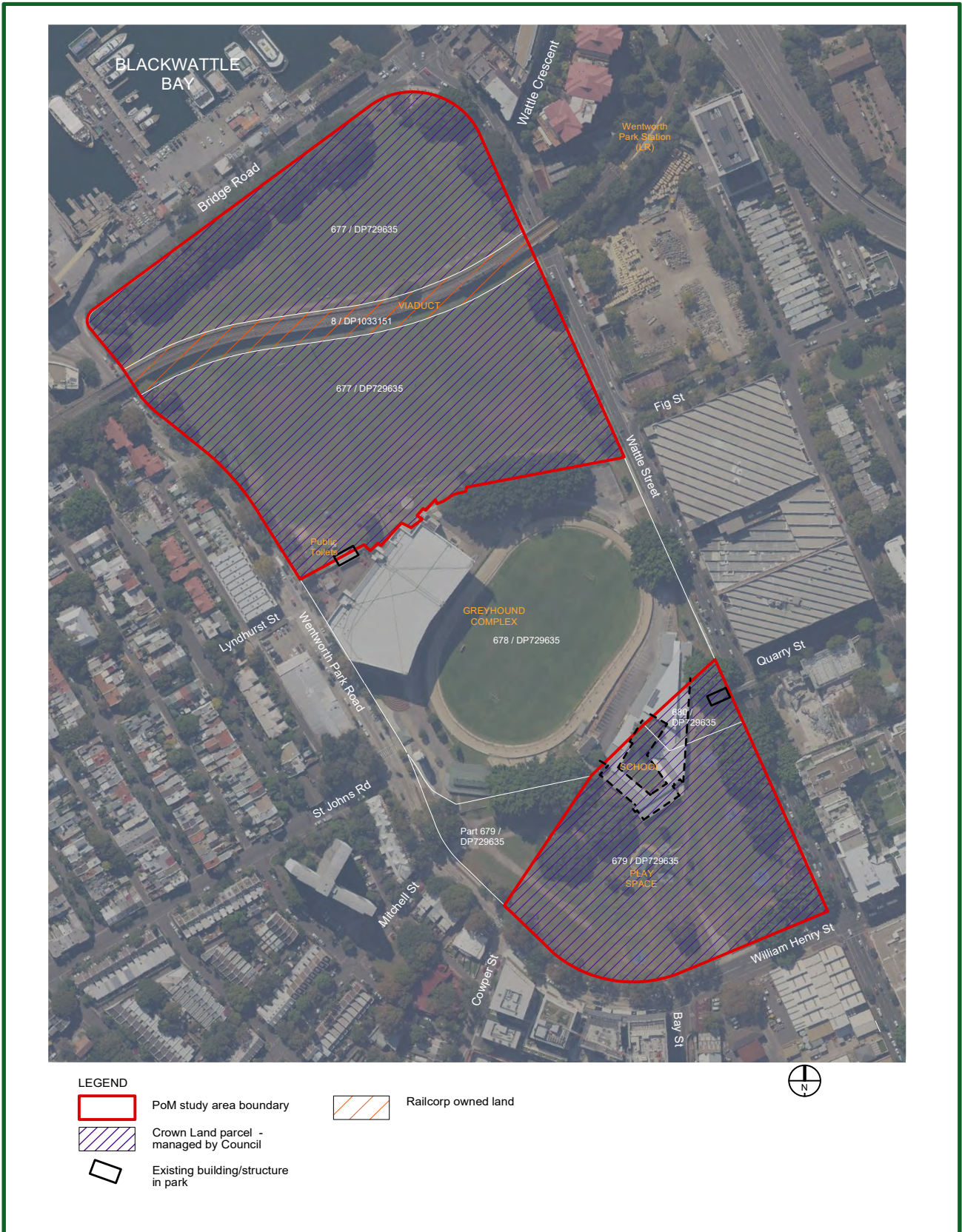
Figure 3. Site Plan