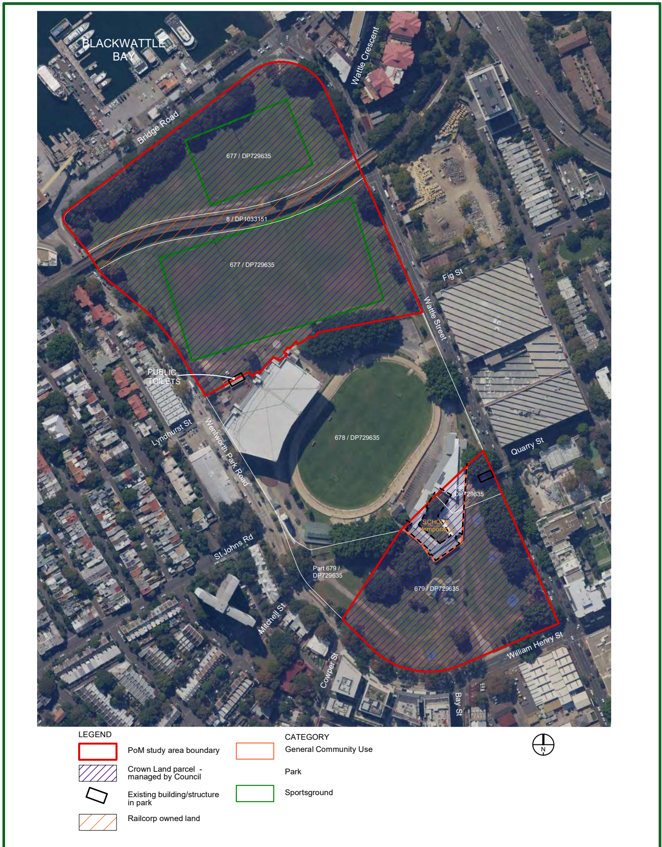
Figure 7. Community land categorisation map